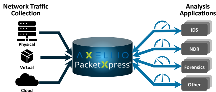
Figure 2: PacketXpress – High-speed network packet data capture, storage, distribution, control, and analysis solution

Axellio’s PacketXpress is a network intelligence platform designed to capture, store, analyze, and distribute all network traffic in an extremely small footprint with no data loss. PacketXpress can handle any network speed, even those above 200 Gbps. This unique, patented software design increases performance and accuracy by avoiding overload situations and the resulting blind spots for real-time analysis. For historical forensic analysis, as well as mitigation validation, PacketXpress also replays any pre-and post-event packet data at any speed for in-depth analysis. It works like a network DVR!