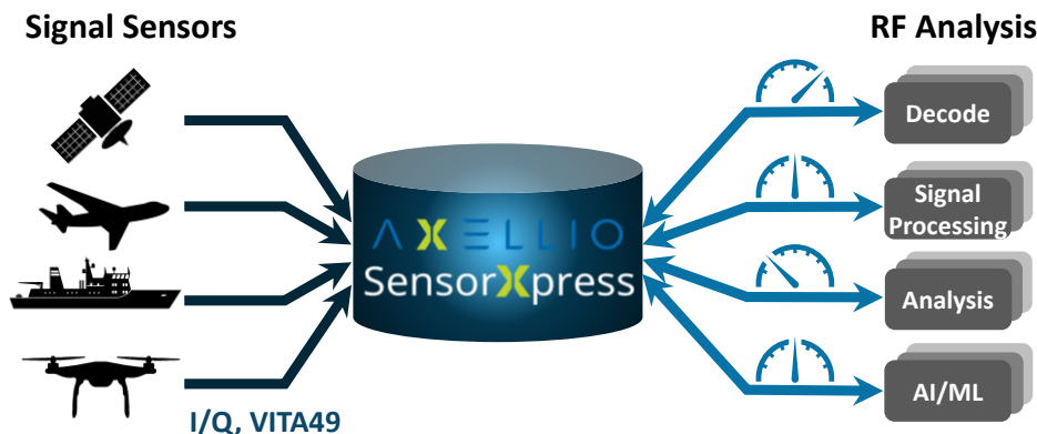
Figure 3: SensorXpress – High-speed network packet data capture, storage, distribution, control, and analysis solution

The SensorXpress solution is designed for the reliable capture and distribution of RF data at extremely high speeds while maximizing storage and minimizing hardware and processing requirements. This is a NextGen RF data ingestion, storage, and distribution solution. Instead of feeding the collected signals from hardware sensors and receivers directly into the signal analysis, decode, or processing systems, SensorXpress can buffer the data between the sensor and RF analysis tools by capturing and storing the RF data. Simultaneously, SensorXpress can distribute the RF data at controlled rates and contents specific to each analysis system, avoiding system overload.