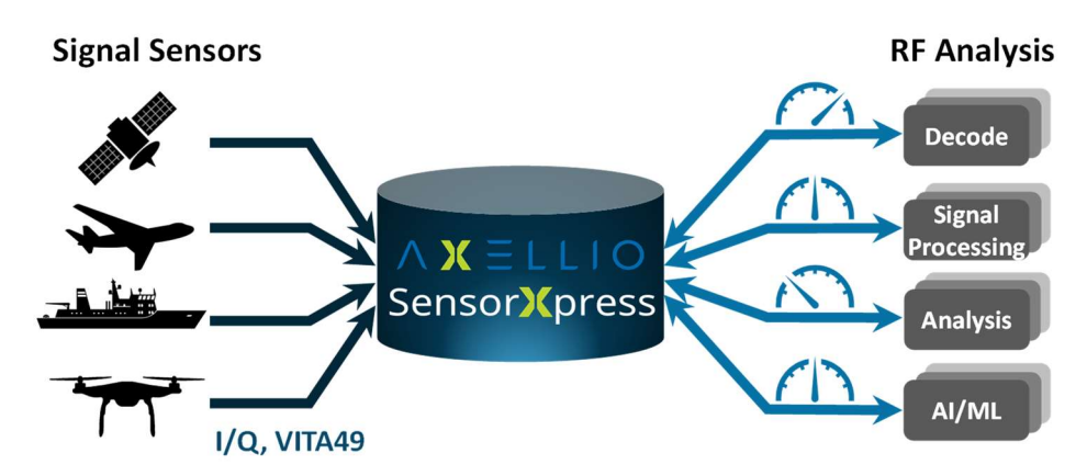
Figure 3 : SensorXpress – High-speed RF data capture, storage, distribution, and control solution

The SensorXpress solution is designed for the reliable capture and distribution of RF data at extremely high speeds while maximizing storage and minimizing hardware and processing requirements. This is a NextGen RF data ingestion, storage, and distribution solution. Instead of feeding the collected signals from hardware sensors and receivers directly into the signal analysis, decode, or processing systems, SensorXpress can buffer the data between the sensor and RF analysis tools by capturing and storing the RF data. Simultaneously, SensorXpress can distribute the RF data at controlled rates and contents specific to each analysis system, avoiding system overload.